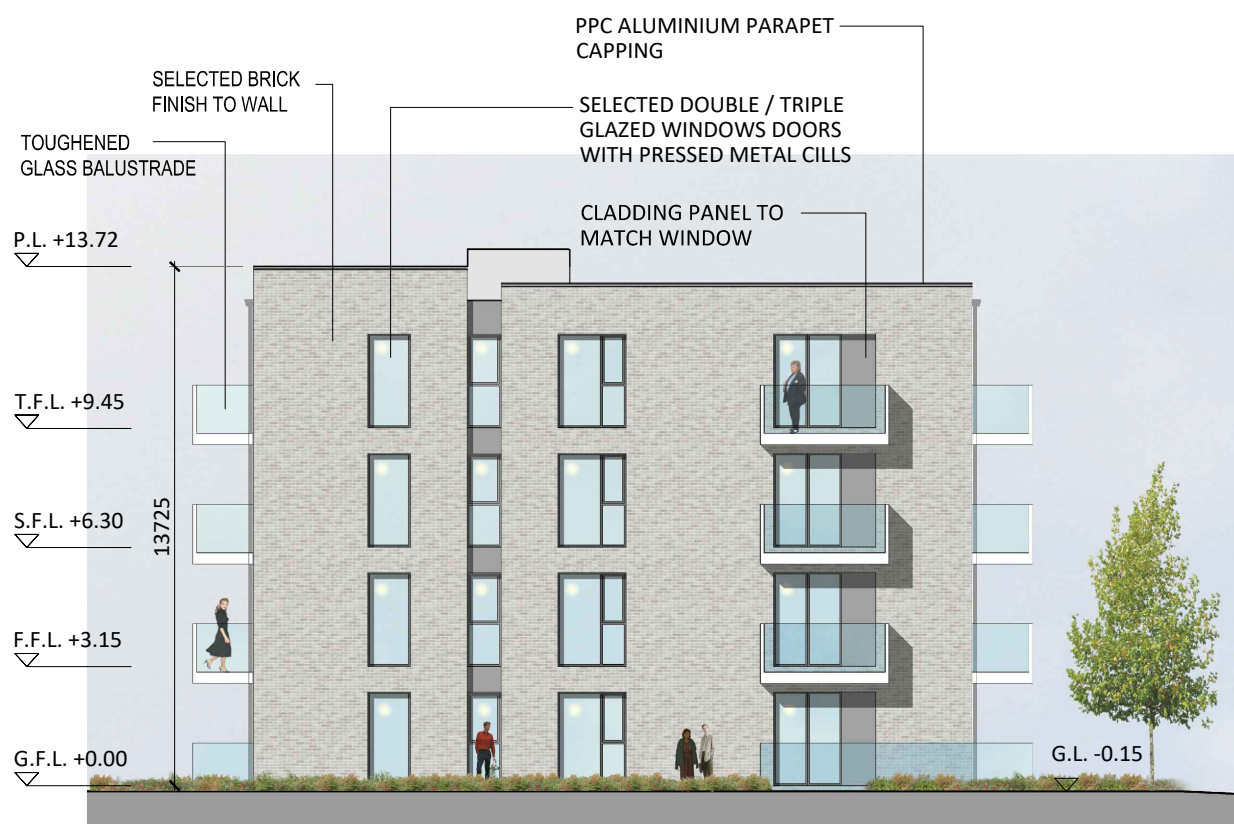
Typical Block - Gable 1 Elevation scale 1:200